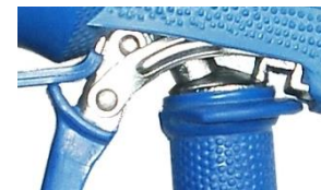
Rubber collar for better protection

Spray guns in brass, chrome plated brass and light weight plastic Special spray guns: for hot water in RED, for large flow in Black, for (foam) lance mounting, for sterilisation and explosion proof