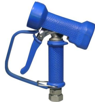
AKRNP01-B-SWR09-3/4 With ball bearing Stainless Steel swivel 3/4" female