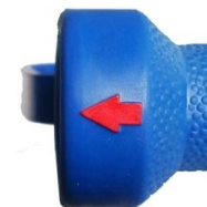
Red arrow for beam direction

*** Although all materials used can withstand temperatures up to over 100° C, it is strongly recommended to take special precautions when using hot water.